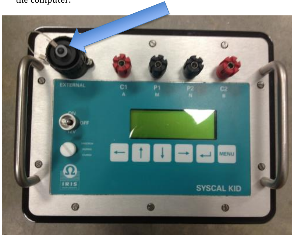
Figure 7 Connect transfer cable here